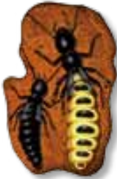
King and Queen

The Queen occupies a royal cell with the king. She may live up to 25 years, laying many thousands of eggs annually.