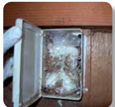
INSPECTION OF EXCEL STATION BY EFLX ACCREDITED OPERATOR